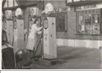
Shirley serving petrol March 1953

Some of the girls in the group including Shirley danced for the Anglo-Australian Ballet when they were over in England. Shirley did pantomime at the Kings Theatre Hammersmith, taking the 705 Greenline bus to many venues. Qualifying with the Imperial Society in